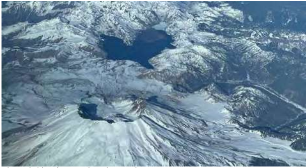
Photo: Spirit Lake & Mt St Helen's, USA