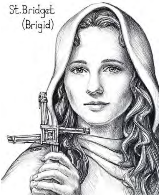
St. Bridget (Brigid)

In February, using l'orque as our theme, we focussed on friendship and compassion. In recognition for all their efforts, the children were rewarded with an afternoon of cooperative games in the classroom. As spring approaches, we have chosen the bear, l'ours, as our symbol for March. The bear in Indigenous cultures represents strength, family, health, and courage. This month, we will focus on the value of courage, in particular, when we may need to look for it during challenging times.. Thank you for continuing to support our Positive Behaviour Support Plan by reinforcing our themes at home.